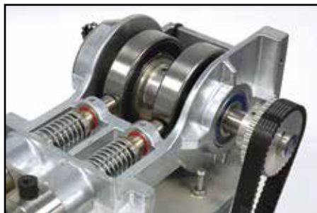
Rugged Construction with Belt Drive and Eccentric Cams.

The HF Series pumps are dual-headed piston pumps with servo motors, belt drives, and reliable eccentric cams. Features include an LCD keypad with advanced HMI/PLC interface, and RS-232 for complete control and status monitoring. Prime-Purge Valve, Outlet Filter, and Pressure Transducer are also included.