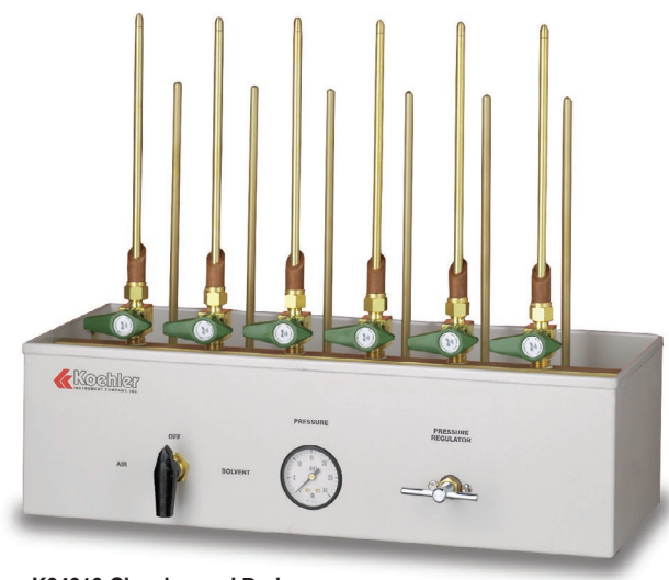
K34010 Cleaning and Drying Apparatus