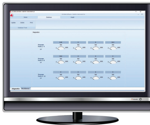
Real-time plot screen displays pressure versus time for up to twelve samples simultaneously.