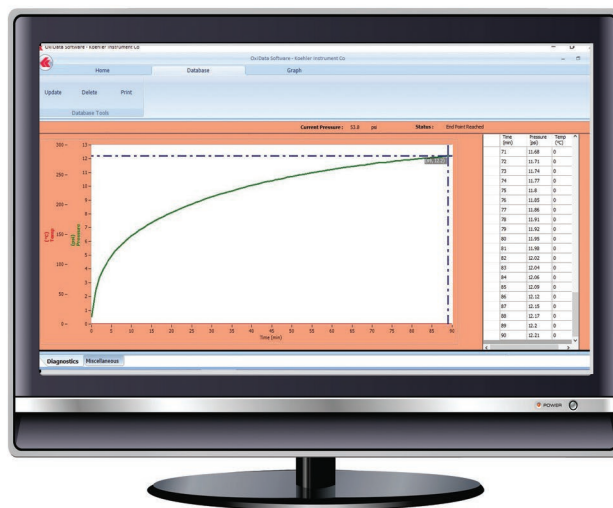
Oxidata® software automatically tracks measured data in real-time and calculates the endpoint of RPVOT (RBOT)/TFOUT test methods